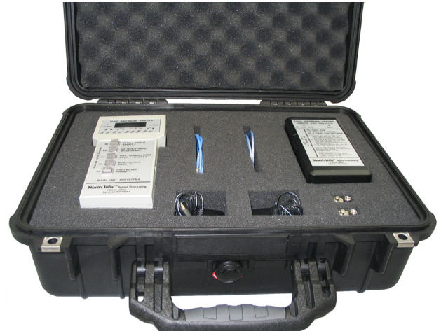
North Hills 1553 Network Tester, Model DBT 100A in storage case.

The display consists of LED go/no-go indicators and a 0.4 inch, 3 1/2 digit LCD readout for the ohm-meter mode (0 to 199.9 Ohms).